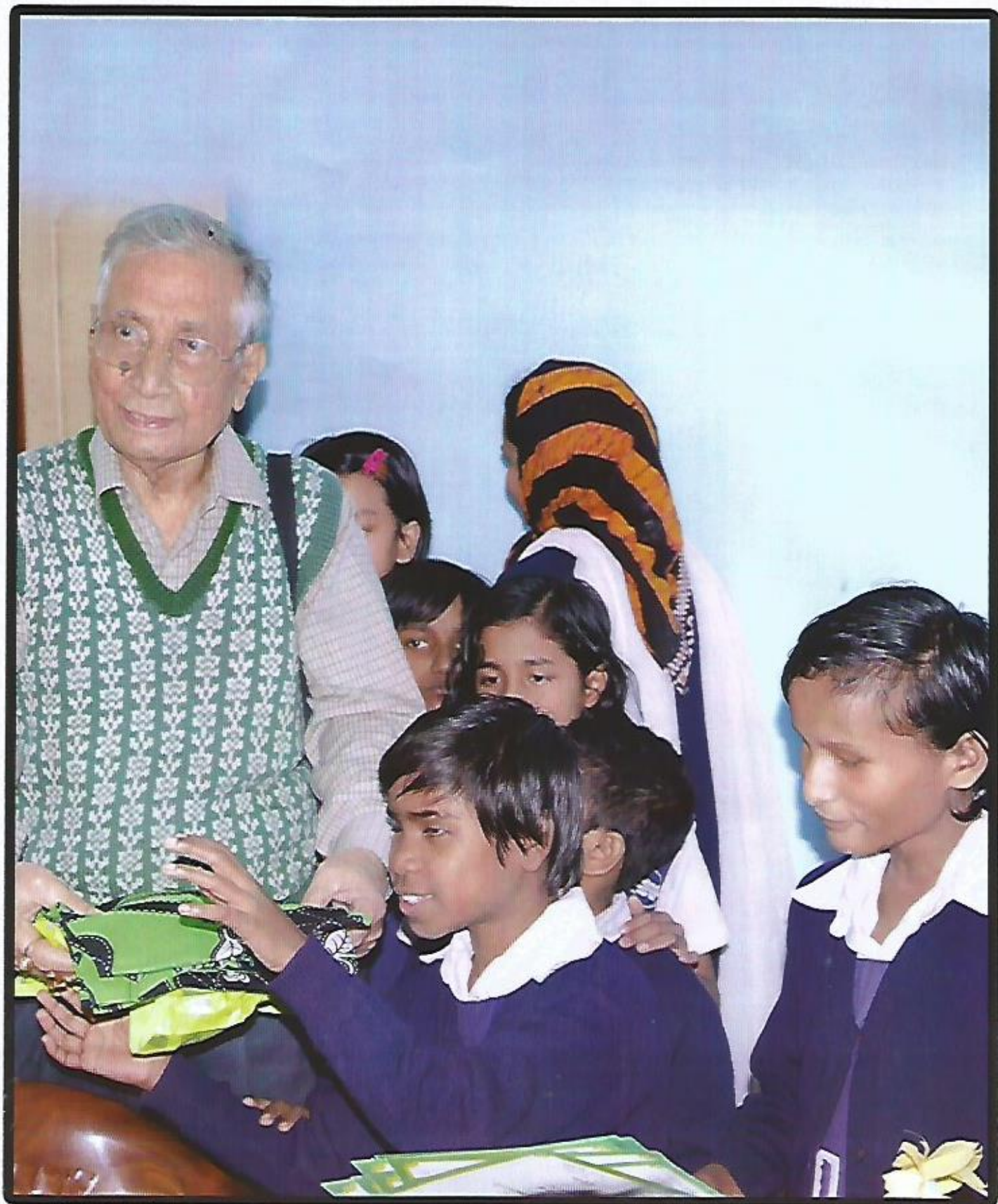
Gift of New Clothes to Blind Children