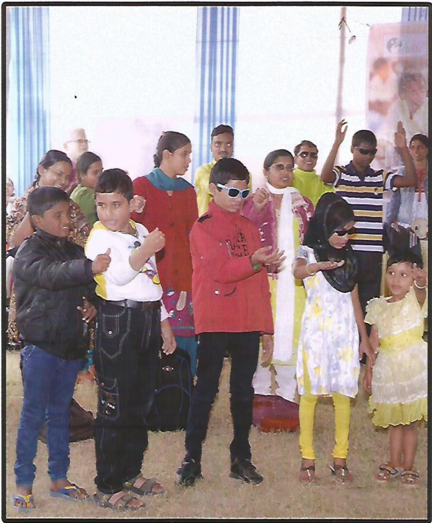
Bidhan Sishu Udyan Louis Braille Day