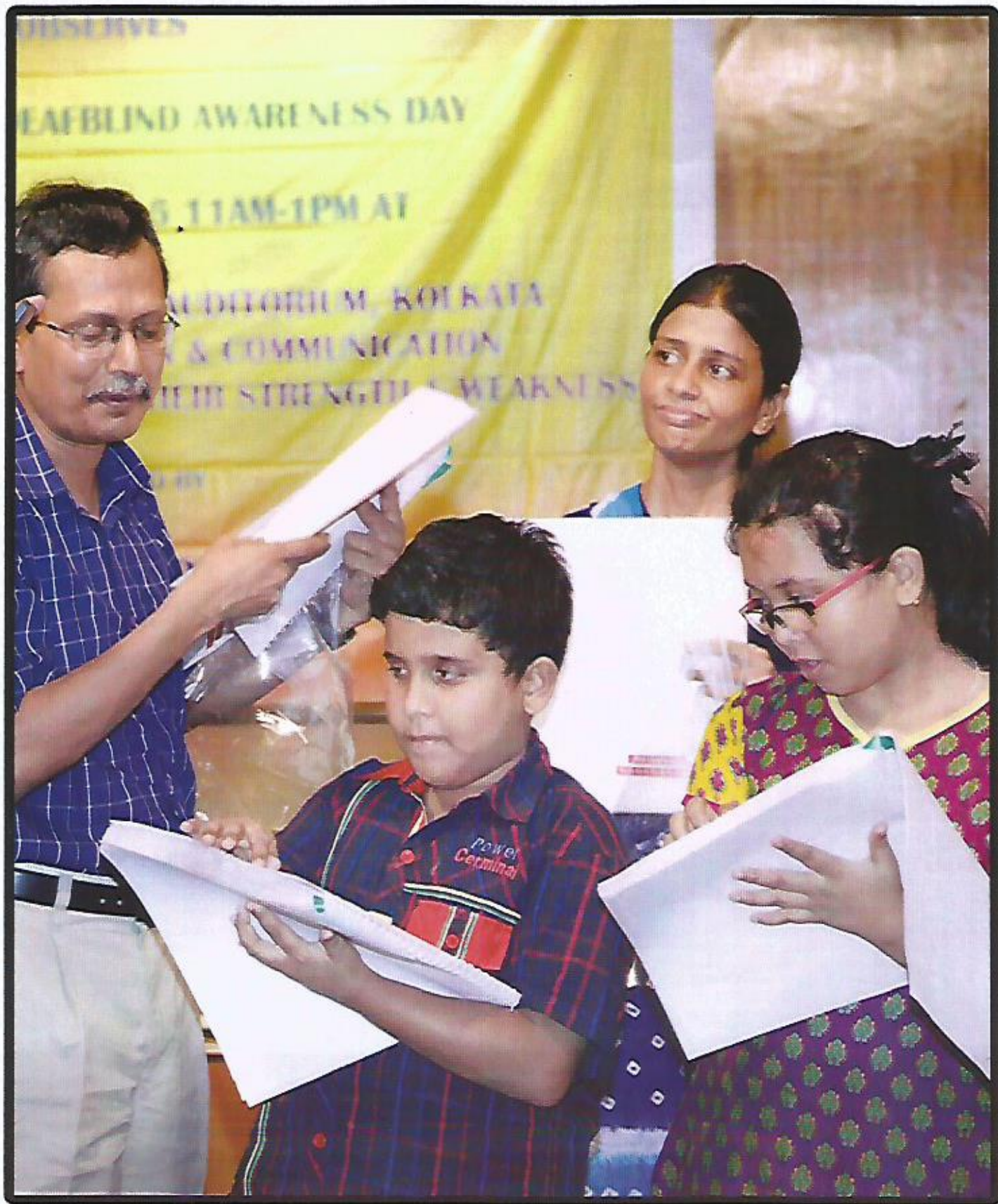
Braille Book Release H K Day